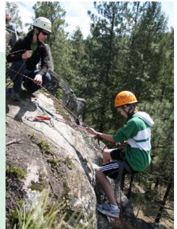
Climbing the Dragon Crag